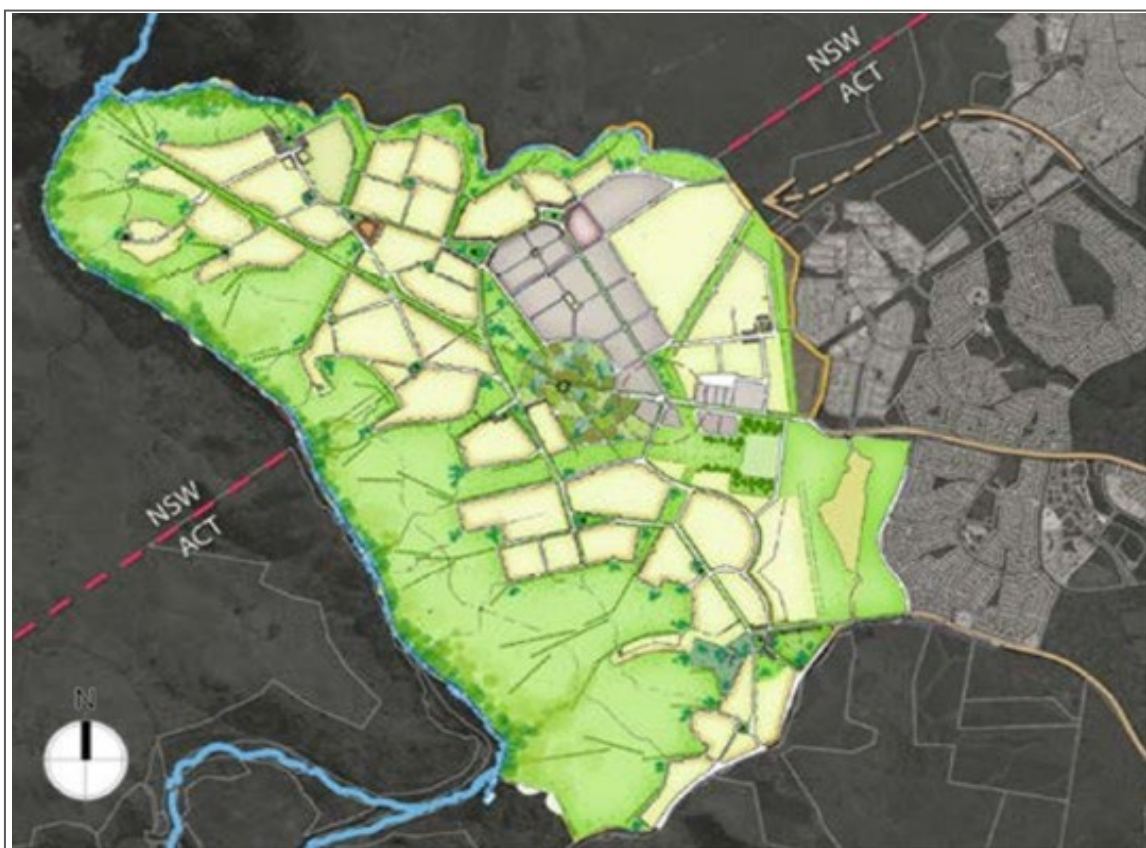
Figure 1-1 Ginninderry and Parkwood