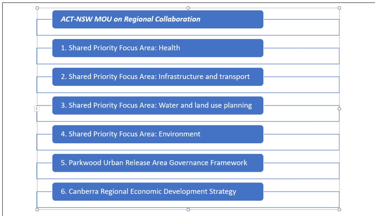
Figure 3-1 ACT-NSW MOU for Regional Collaboration (2020) Priority Focus Areas